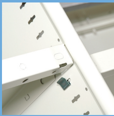
Shelves Adjustable shelves - 25mm increments