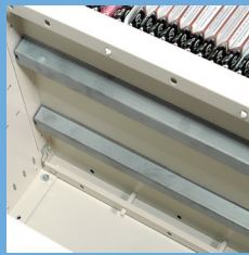
Shelf Stiffeners Increase shelf load carrying capacity 900x400mm - up to 130kg Add Stiffener - up to 240kg