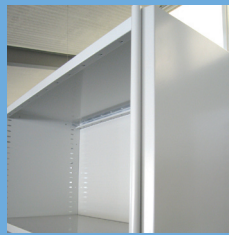
Finishing Panels Add on frame finishing panels, rear covers and top extrusions provide a clean smart finish