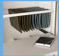
Accessories A full range of accessories are available to customise your storage requirements